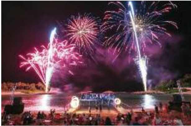
There is always an amazing fireworks show at the end of the event in Ko Olina

It's hard to believe, but the 6th Annual Hawaii Food & Wine Festival is upon us. What started as an idea Hawaii's own James Beard Award winning top chefs, Roy Yamaguchi and Alan Wong came up with six years ago has exploded into