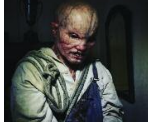
Haunted Plantation Villages returns for the 11th frightening year

This year Halloween falls on a Monday. While Waikiki is still certain to be filled with crazy party people dressed in everything from devils to divas that night, the entire month of October comes alive with events for the whole family and the truly fearless. Here are a few fun and even frightening events you might check out.