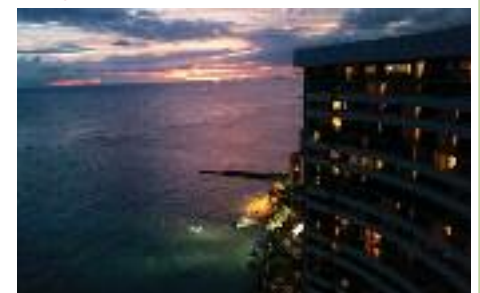
Just a reminder of how lucky we are to live and work in this place we call home, that so many save up for years to come visit. Took a recent staycation at the Sheraton Waikiki and was reminded of that myself. #luckywelivehawaii