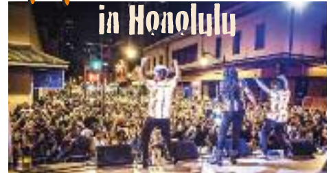
Over 10,000 people made their way into Chinatown last year for Halloween. This year will be even bigger.

Get your inner zombies ready. Halloween falls on a Saturday this year, so Kalakaua Avenue is sure to be crawling with ghosts and goblins and more as party revelers converge into the night to celebrate. Countless bars and restaurants around town will be hosting special events (usually with oh-so-special cover charges) in honor of this beloved tradition that justifies both eating candy and gives you one of the best excuses all year to get dressed up and party! By far the biggest festivities will take place in Waikiki and downtown. But there's more out there than just a big party or twelve. Let's take a look at how Honolulu will be celebrating Halloween this year.