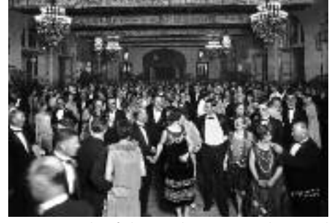
Opening night of The Royal Hawaiian in the Grand Ballroom on February 1,1927.