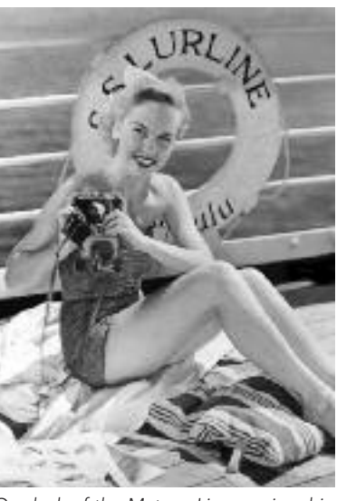
On deck of the Matson Lines cruise ship S.S. Lurline en route from San Francisco to Honolulu late 1940s.

In order to generate excitement and allure for Hawaii as a world class tourist destination to fill these newly built rooms, Matson developed an ambitious and enduring advertising campaign that involved the creative efforts of famous photographers such as Edward Steichen and Anton Bruehl. In