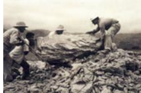
Labor missionaries volunteered to build the Center.

members started hosting a hukilau as a fund-raising event, and it proved that tourists would come to La'ie and that the various Polynesian groups could work together as one. Conversations soon began about the idea of building authentic houses from several Polynesian islands, and in early 1962, construction began. Over 100 labor missionaries volunteered to help build the Polynesian Cultural Center's original 39 structures around a twelve-acre taro patch. By importing materials and artisans from the South Pacific, village houses were crafted