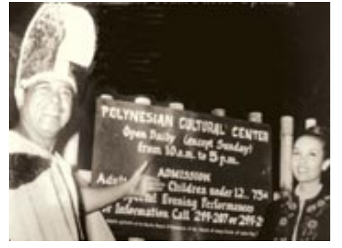
A peek at the opening sign.. and prices!

We are already consistently voted the Best Oahu Attraction and Best Oahu Luau, but our goal is to become even better, one tiny improvement at a time."