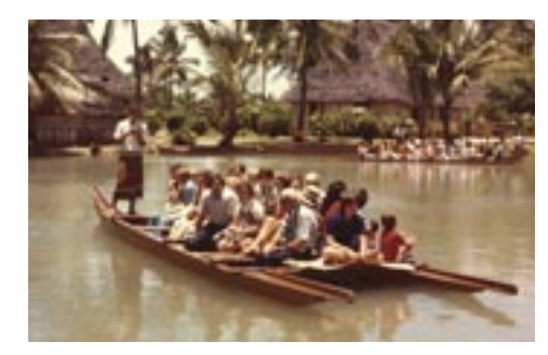
Canoe rides have been going on for decades

The next decade brought many more additions to the Center, including the Hawaiian Mission Settlement, Migrations Museum, a 1920-style store, and a totally