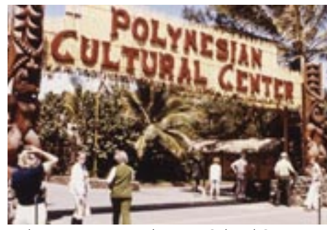
The entrance into Polynesian Cultural Center in the 70s.

In the mid 1800s, Mormon missionaries landed in Tahiti and surrounding Polynesian Islands, where they lived among the people and learned their languages. By 1850, they had reached the Sandwich Islands (Hawai'i) and soon purchased a 6,000-acre plantation in Lā'ie. The LDS Temple started in 1915, was dedicated in 1919, and began to lure more members from the South Pacific. Church leader David O. McKay first conceived of a school of higher learning to educate the young people who flocked to Lā'ie, and in 1974, the Church College of Hawai'i became a campus of Utah's Brigham Young University. From these humble beginnings, the idea of revitalizing cultures from the South Pacific was born and has slowly and steadily grown over the decades.