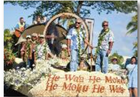
Hawaiian Airlines float with the first Hokule'a crew in the 2013 Aloha Festivals Floral Parade.

Every September, for 68 years, Hawaii has thrown a great party for itself. Called Aloha Festivals, it is one of Hawaii's most highly regarded, and oldest cultural celebrations. Of course visitors lucky enough to be in Waikiki are all invited. Many attend once, become true fans, and plan a trip every year in time for one or more of the free, fun events. The 2014 Festivals take place from September 6th to 27th at various locations on Oahu.