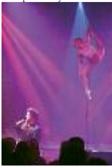
What this athlete does on this pole is sheer athletic grace