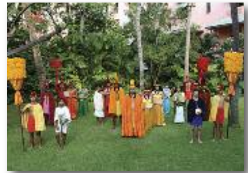
The 2013 Royal Court at Royal Hawaiian Center Royal Grove for the Opening Ceremony.

Through history, the royalty of Hawaii have