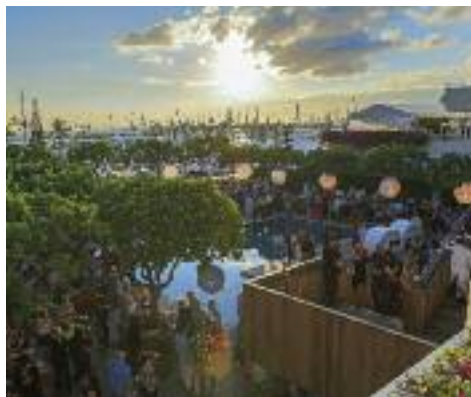
The Modern Honolulu plays host to the first Oahu event

Hudson Valley Foie Gras in N.Y., will honor the Lucky Buddha with creative dishes, joined by sixteen Master Sommelier. "Relax, meditate and reach Nirvana" is the description of the evening's most zen experience, Sushi, Sake & Soju for four offered on the private lanai by Chef Morimoto.