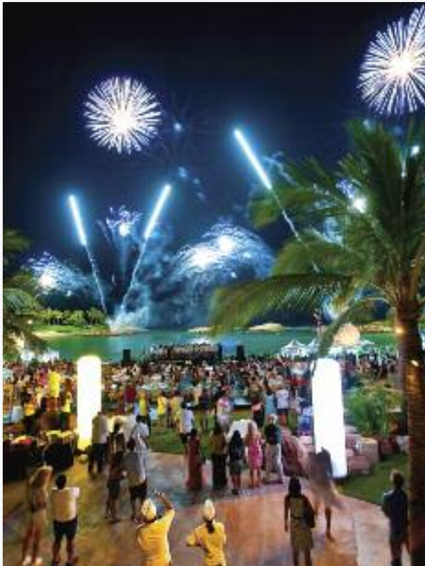
The fireworks at the end of the Hawaii Food and Wine Festival are always spectacular. Don't miss this year's closing event, It's a Food World After All.

The 4 th annual Hawaii Food and Wine Festival Returns