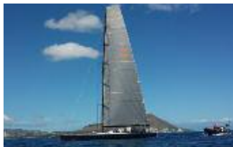
Those of you lucky enough to be looking out by Diamond Head at the end of July might have caught sight of some of the amazing boats that participated in the Transpac Yacht Race from Long Beach to Oahu. This was Rio 100. Sadly most came in at night.