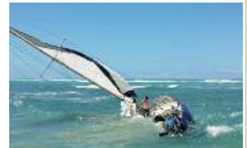
During Transpac surf was at an all time high. Officials made many of the entrants stay outside the harbor if they finished at night to make sure they didn't end up like this local boat who went out for Friday night fireworks and got

Do you have a picture you would like us to run? Send them to: publisher@oahuconciierge.com