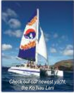
Check out our newest yacht, the Ko Nau Lani

We're a family-operated business dedicated to service, safety, quality & fun! Ocean activities for all ages and budgets. We're at your service to help provide a perfect match for your client.