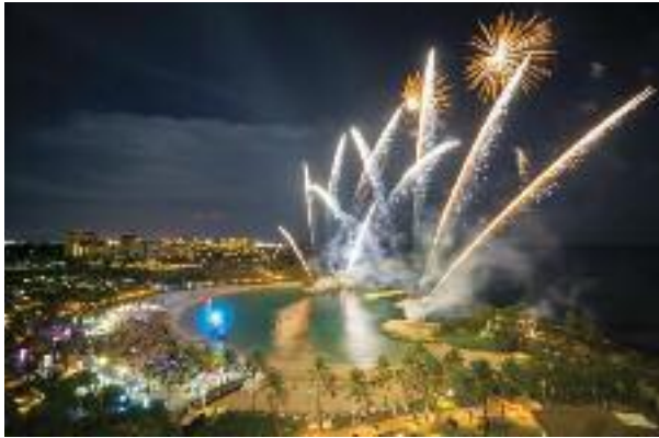
Fireworks closed out the show in Ko'Olina last year.

It's September and you're hungry. The solution is easy - buy tickets to the multitude of munchable events that are part of the 5th annual Hawaii Food & Wine Festival. The delicious events begin on August 29th on the Big Island, move to Maui, and then onto Oahu, running through September 13th.