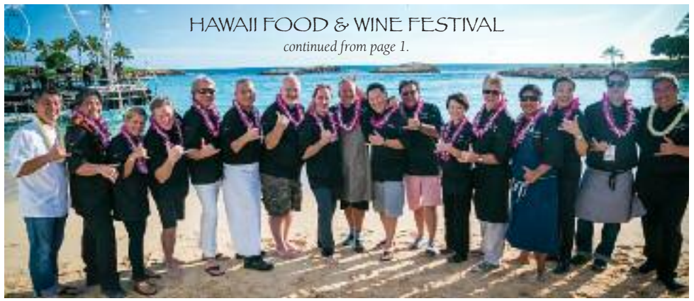
Participating chefs at last years closing event at Ko‘Olina.

all-day event, keiki will have an opportunity to meet and take photos with celebrity chefs, watch chefs demonstrations, enjoy Hawai‘i’s best food trucks, participate in friendly physical challenges, shop at their Made in Hawai‘i Marketplace and enjoy live entertainment. This is a don’t miss event as your family will have fun while learning the importance maintaining a healthy local lifestyle and best of all? Tickets are only $5! Admission is free for those guests staying at the Outrigger Reef or Waikiki! Just show your hotel room key and two adults and two children come in at no charge.