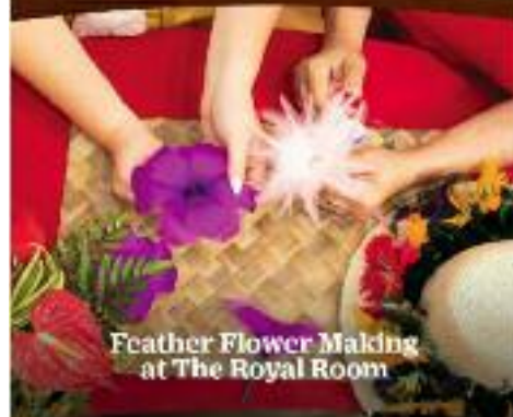
Feather Flower Making at The Royal Room