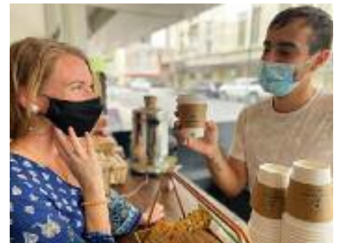
The recently opened Cool Beans Coffee Shop at The ARTS has become a popular destination for early morning coffee and late afternoon tea for residents & visitors.

Anniversary Gala Fundraiser due to the rising COVID cases, but, in its place, they are launching a "20-for-20" donation campaign asking visitors to donate $20 when they come into the space to help support this iconic home for the arts.