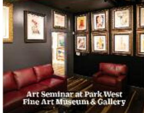
Art Seminar at Park West Fine Art Museum & Gallery