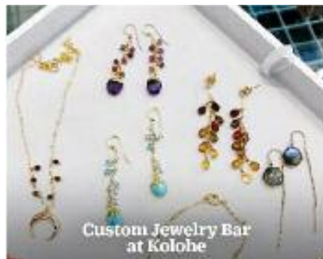
Custom Jewelry Bar at Kolohe

Web: toddenglish.com • IG/FB/Twitter: @cheftoddenglish • See HFWF information at: hfwf.me