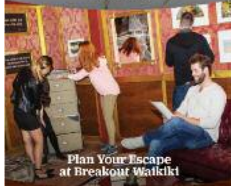
Plan Your Escape at Breakout Waikiki