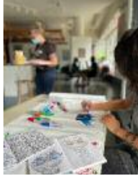
Artists at work and Chinatown residents enjoying coffee.

administrative space, office equipment, and offering clerical assistance for arts organizations in addition to hosting classroom space for art classes such as watercolor painting, ceramics, glass blowing, fabric printing. It is also a performing arts class space for acting, dancing, and slam poetry.