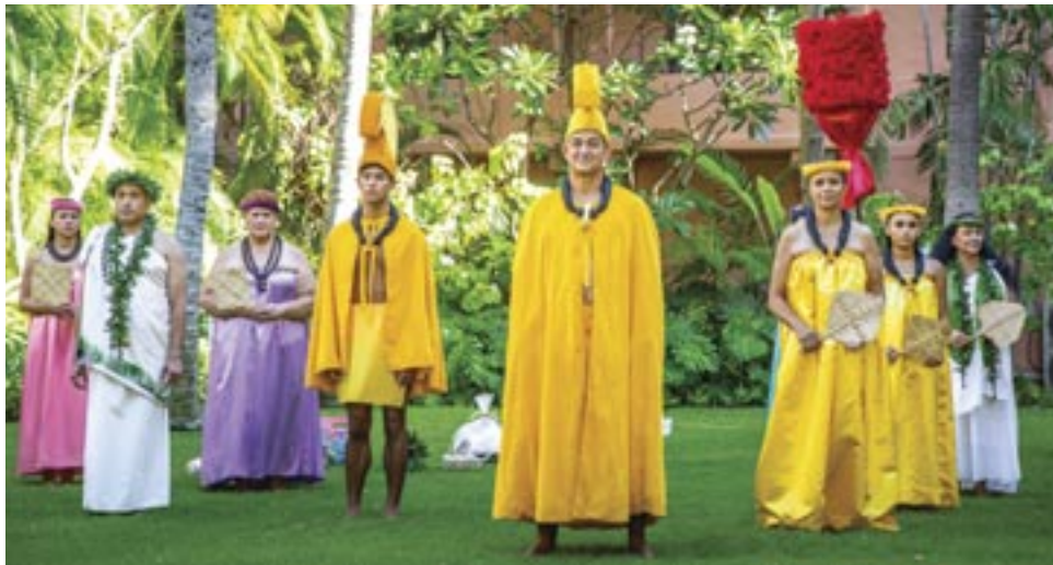
The Royal Court Investiture & Opening Ceremony is the official kick off of the 2023 Aloha Festivals. All photos courtesy of The Aloha Festivals.