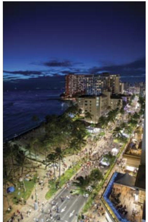
Kalakaua Avenue teems with people during the ho'olaule'a

People will be literally dancing in the streets near the stages throughout the evening. It's an experience for all to enjoy.