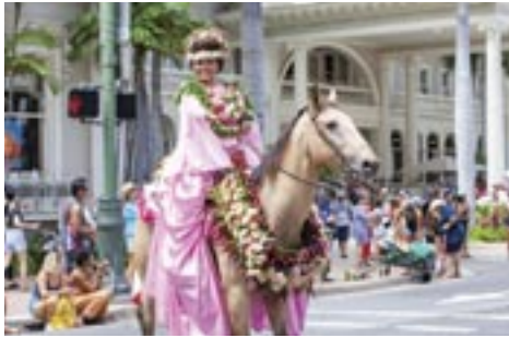
The pa'u riders are always a parade highlight personal experiences with our visitors.

In addition to encouraging everyone to go out and explore our 'aina, several signature events make up the Aloha Festivals that visitors will want to attend. They can watch and participate in several fabulous events celebrating our identity. That includes watching a little Hawaiian pomp and circumstance with the Royal Court Investiture & Opening Ceremony. On Saturday, September 9th, the Aloha Festivals Royal Court will be introduced on the grounds of Helumoa, originally the home of Princess Bernice Pauahi Bishop. The investiture is a ceremony at which honors or rank are formally conferred on someone and will begin at 4 p.m. The king, queen, prince, and princess will then take their place on the royal court as part of the Opening Ceremony that starts at 5 p.m. As representatives of Hawai'i's past, the Aloha Festivals Royal Court ensures the festival is rooted in the most cherished traditions of Hawai'i. The Ali'i court members will receive royal cloaks, helmets, head feather lei, and other symbols of their reign at the Royal Hawaiian Hotel's Coconut Grove. The