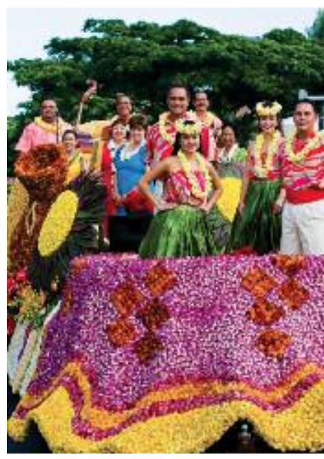
The annual Floral Parade is definitely one of the highlights of the Aloha Festivals. Don't miss this year's parade on the 29th.

and the 2nd Annual Kiki Couch Shall Blowing Contrat from 12:30 - 2 p.m. This will be a full day of free activities, demonstrations, arts and crafts and continuous stage performances.