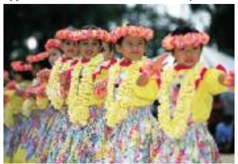
The Aloha Festivals perpetuates the Hawaiian culture with the Keiki Hoʻolaulea held at Pearlridge Center on Sept. 15th.

For those heading out of Waikiki, there will be a special Kiiki Hoʻolaulia at Pearlridge Center Uptown from on Saturday, September 15th from 10 a.m. to 3 p.m., which will also include a special appearance from the Aloha Festival Royal Court