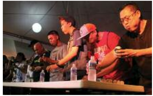
and celebrate the elements that unite Got Musubi? Whoever chows down the most musubi wins a trip to Vegas!