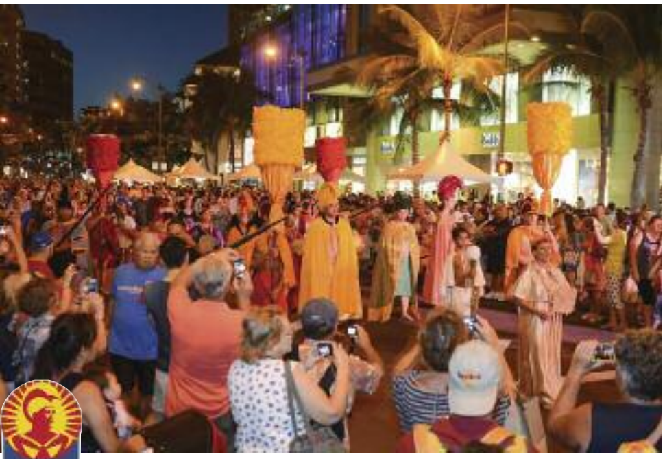
The Aloha Festivals Waikiki Hoʻolauleʻa is one of the premiere events of the festival. Be sure to make your way down to Kalakaua Avenue on Saturday, September 22nd from 7 - 1 0 p.m. for one of the largest block parties of the year filled with live entertainment, food, and crafts.

The Aloha Spirit is one of the many things that make Hawaii so special. It refers to how people in Hawaii treat each other. The Aloha Spirit is who we are. It represents how all people should be treated,