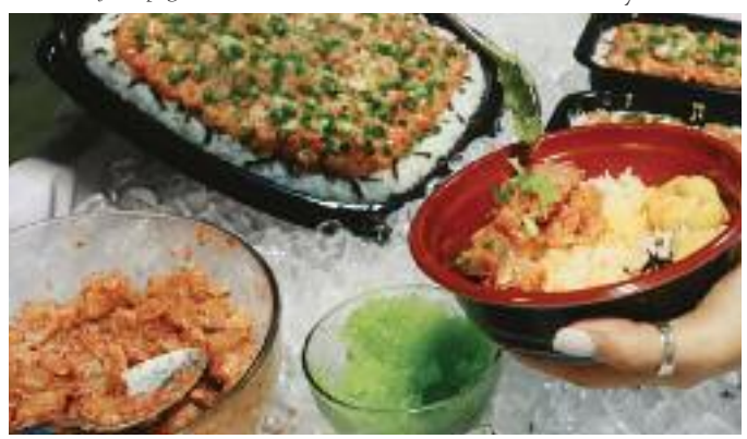
The 2nd annual Honolulu PokeFest is moving to the parking lot of Ala Moana Center outside of Morton's to accommodate demand.

toppings as presented by upstart poke purveyors. The poke war picked up again this summer when news broke that Chicago-based Aloha Poke Co. had trademarked its name and sent cease-and-desist letters to local businesses that had already been using the words "aloha poke" in their names.