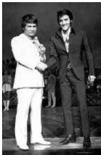
Icons in the entertainment industry, Don Ho and Elvis Presley back in their heyday.