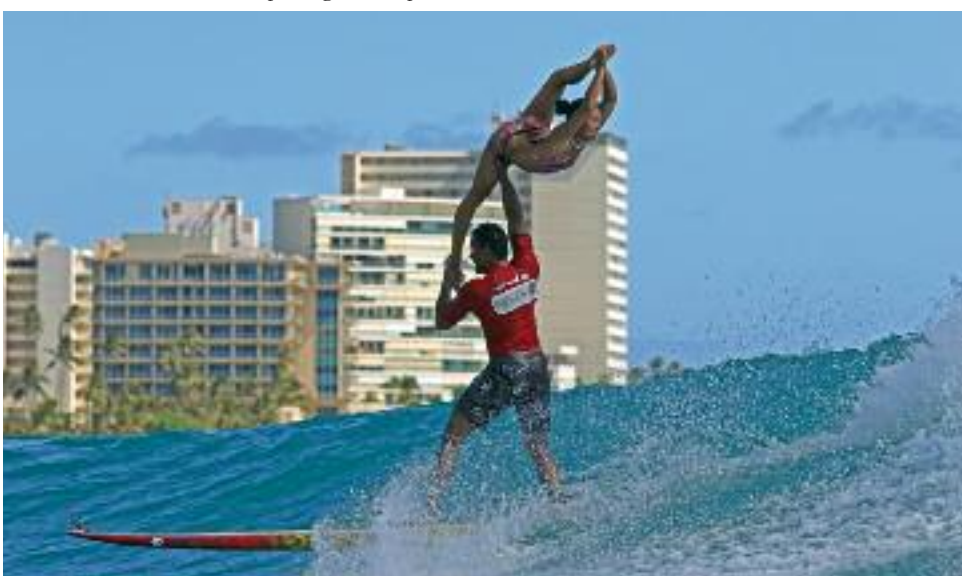
The Tandem Surfing Championship is always a crowd pleaser.