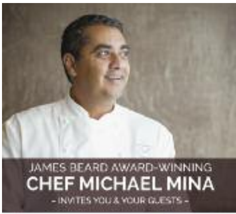
JAMES BEARD AWARD-WINNING CHEF MICHAEL MINA - INVITES YOU & YOUR GUESTS -

Over 40 vendors offering locally grown fruits and vegetables, plants and freshly made treats. A pop-up cafe offering seating and live music round out the day. Free. 8 a.m. - noon. PearlrIDGEOnline.com.