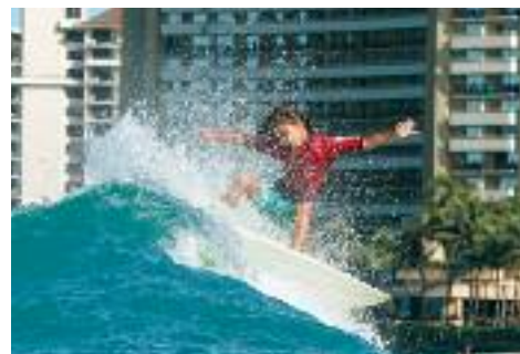
The groms kick off the contest with the Menehune Surf fest.

Most events take place on Kuhio Beach. The Amateur Longboard & SUP Surf Classic will be held from August 21st- 23rd. Offering eight different amateur divisions and several Pro divisions, there is $5,000 up for grabs in prizes.