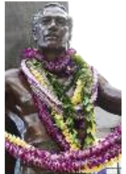
The Duke statue.

Every summer, Waikiki's premier ocean sports festival takes place in honor of Hawaii's legendary waterman, Duke Kahanamoku. Held over nine days, Duke's OceanFest offers just about every kind of water competition there is, plus a few land and sand events for competitors of all ages and skill levels.