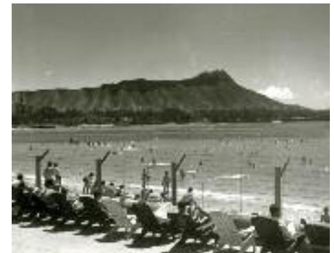
Waikiki Beach was lined with barbed wire and the Royal Hawaiian Hotel was taken over by the US Navy for military R & R throughout the entire war. This is one of the many pictures that are part of HOMEFRONT.

Once they have accomplished that I recommend they visit " Homefront Hawai'i: Pearl Harbor 75th Commemoration " The exhibit honors the memory of the attack on Pearl Harbor and bring the stories of those who experienced it first hand to life. The exhibit is located in the Portico Hall in the Hawaiian Hall Complex. There are some stunning images of Waikiki Beach surrounded in barbed wire fencing, and other fascinating pictures from the era including rarely-seen photos of explosion-damaged Honolulu streets, and a bomb shelter at 'Iolani Palace. Period artifacts will also be displayed, such as remnants of a shot-down Japanese plane.