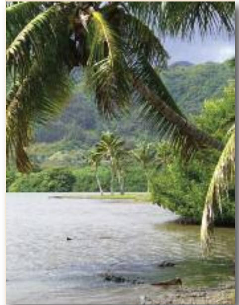
The shoreline as seen from the ocean's edge of Kualoa Ranch.

Discover Kualoa Ranch. What? You think you already think you know it? The new year presents an opportunity to enjoy one of Oahu's best nature escapes in an all new way. The series of events will kick off on January 18th from 9 a.m. to 4 p.m. Two additional, day-long Discover Kualoa events will be held February 15th and March 15th.