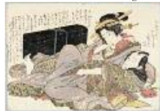
Keisai Eisen, Couple Besides Painting of Plum Tree , c. 1823. From the series. Picture Book: The Beautiful Grass of Women (Ehon fukamigusa) Japan, Edo period (1615-1868) , c. 1823.

Honolulu Museum of Art, takes a slightly risque peek at Japan's erotic art of the 19th-Century.