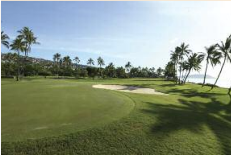
The beautiful beachfront Waialae Golf Course will be the backdrop for a nationwide audience as the Sony Open returns to the Islands bringing some of the top names in golf for a week of golf madness.

And here it is, Tournament Week for the 2014 Sony Open in Hawaii. The open, one of the world's and certainly Hawaii's, premier golf event tees off on Monday, January 6th and runs through 12th, at Waialae Country Club. Returning to defend his title, Russell Henley, who finished with a tournament record-24-under 267 to capture his first PGA Tour victory earlier this year at the 2013 Sony Open. The buzz is on about Japanese golf stars Ryo Ishikawa and Hideki Matsuyama, along with Zack Johnson, Charles Howell III, Adam Scott, John Daly and 15-year old Chinese golf prodigy Guan Tianlang.