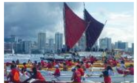
The Hokule'a sailed home admist thousands of people on canoes, OC-1's, SUPs, kayaks, surfboards sailboats, motor boats and more. It was one beautiful spectacle after the other, all day long, that rolled chicken skin, Aloha, and #luckyweivehawaii into one.