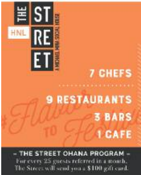
THE STREET OHANA PROGRAM – For every 25 guests referred in a month, The Street will send you a $100 gift card.