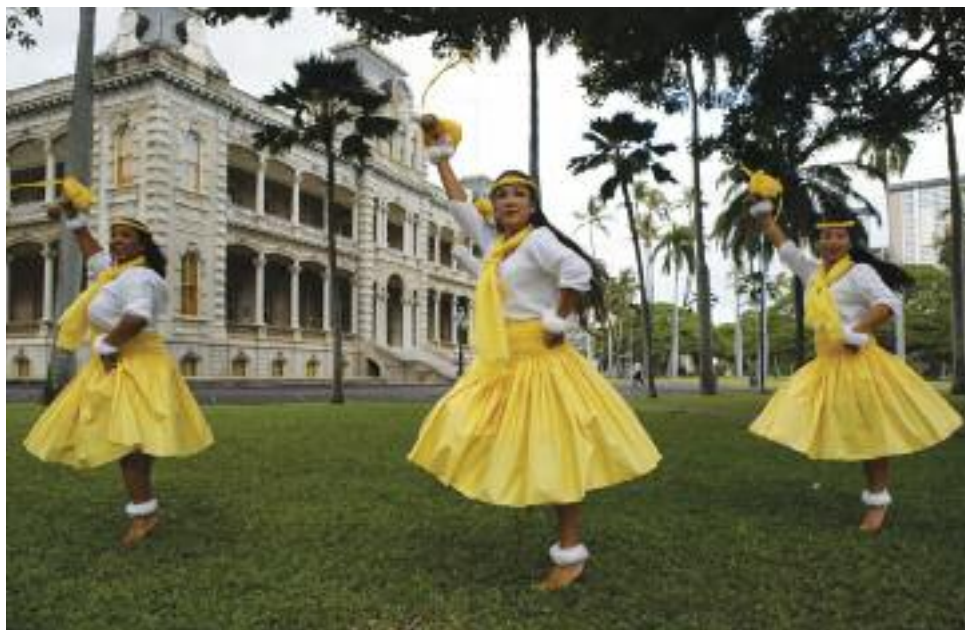
Halau Hula Ka No'eau dances in front of Iolani Palace, where this year's 40th annual festival will be held on July 15 th - 16 th.

The 40th Anniversary the Prince Lot Hula Festival will be celebrated on the lawn of Iolani Palace, the original home of Prince Lot. Laukanaka Ka Hula... Throngs of Hula People Gather will be held on Saturday and Sunday, July 15 and 16, 2017.