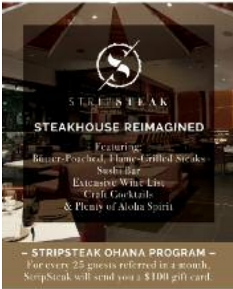
STRIPSTEAK OHANA PROGRAM – For every 25 guests referred in a month, StripSteak will send you a $100 gift card.