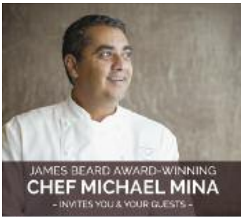
JAMES BEARD AWARD-WINNING CHEF MICHAEL MINA – INVITES YOU & YOUR GUESTS –

DOWNTOWN GALLERY WALK & CRAFT FAIR First Friday has become such a success that events carry over to the second Saturday. HISAM, 11 a.m. –