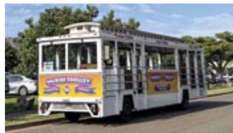
The Waikiki Trolley offers a dedicated Sony Open Shuttle throughout the tournament.

Please remind your guests to review the bag policy before heading to the Sony. There will be no bag check at the tournament. Only bags smaller than 6" x 6" x 6", clear bags smaller than 12" x 6" x 12", diaper bags and medically necessary bags will be allowed in. Camera cases, backpacks, binocular cases, tote bags, seat cushions and