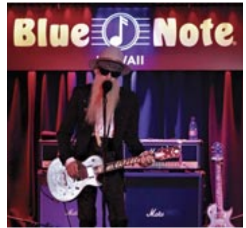
ZZ Top's Billy Gibbons is another regular at Blue Note Hawaii.