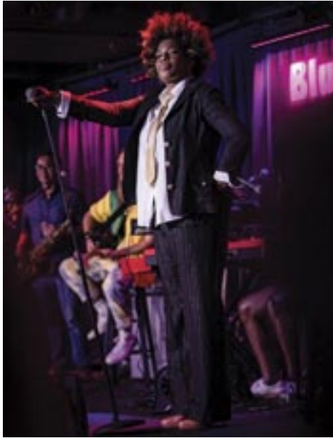
Macy Gray is one of the many Grammy Winners to take the stage here in Hawaii.

Because of its global reputation, Blue Note Hawaii attracts artists who previously bypassed the islands. International jazz and soul icons such as Chick Corea, Marcus Miller, Robert Glasper, Chris Botti, Kenny G, and Eric Benét have graced its stage. Legendary vocalists and Grammy winners including Macy Gray, Lisa Fischer, Brian McKnight, and Tower of Power have also performed, making the venue a magnet for world-class talent.