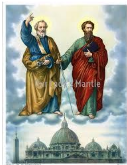
STS. PETER AND PAUL