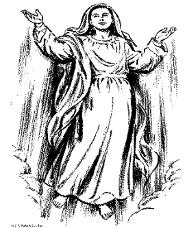
The Assumption of The Blessed Virgin Mary