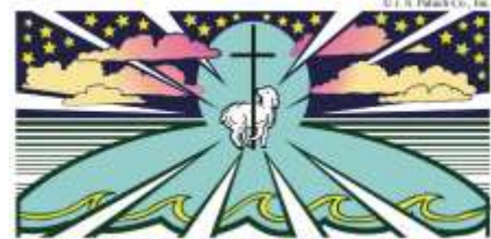
© J. S. Patack Co., Inc.