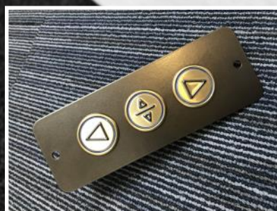
Brass buttons on bronze back-plate