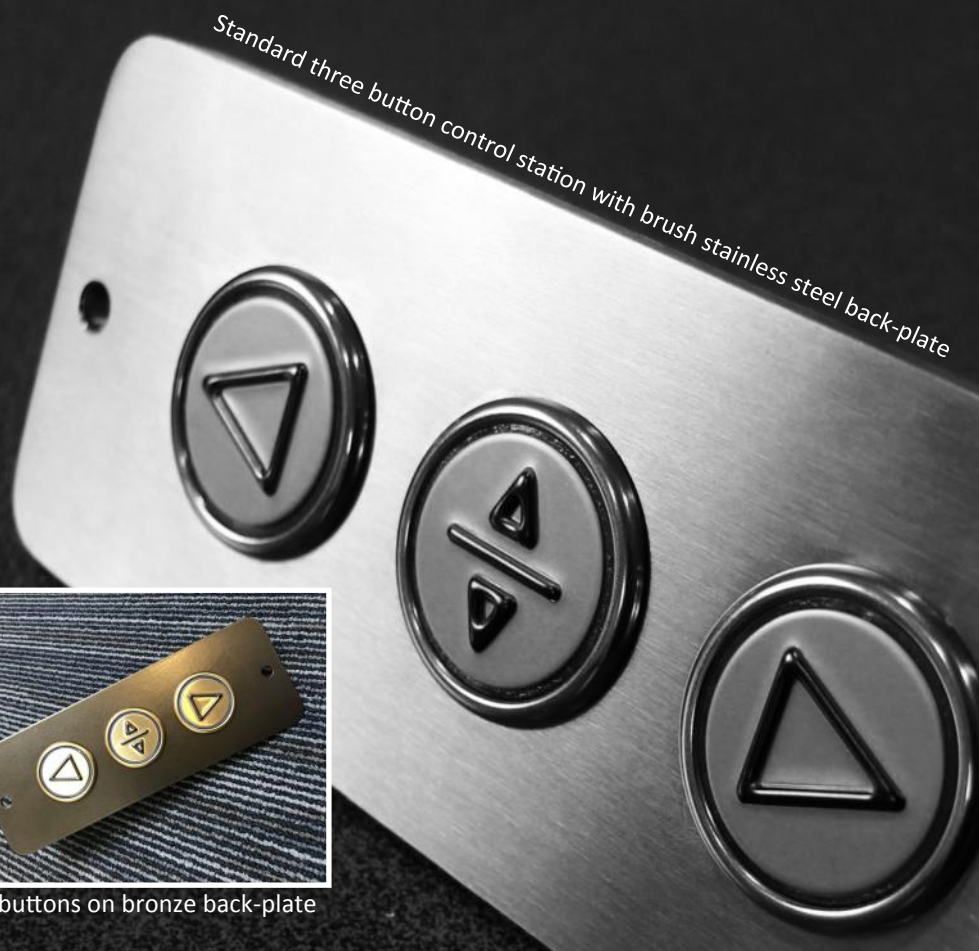
Standard three button control station with brush stainless steel back-plate