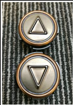
Bronze push buttons