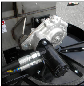
6:1 Hydraulic Drive Gearbox