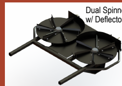
Dual Spinner w/ Deflectors