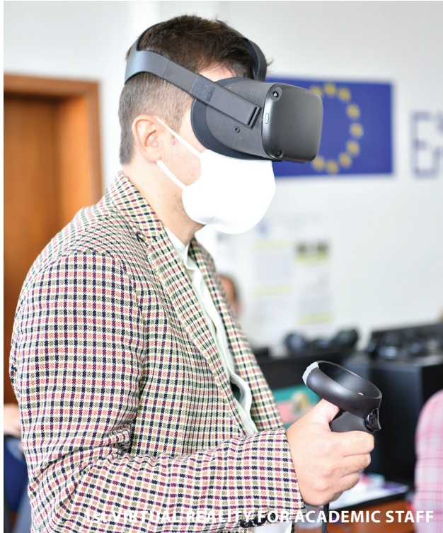
1st VIRTUAL REALITY FOR ACADEMIC STAFF