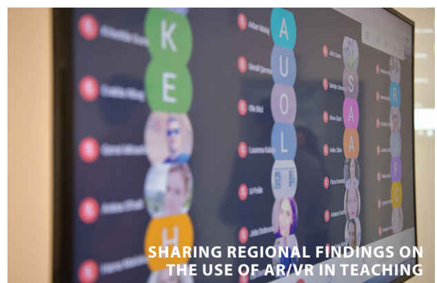
SHARING REGIONAL FINDINGS ON THE USE OF AR/VR IN TEACHING