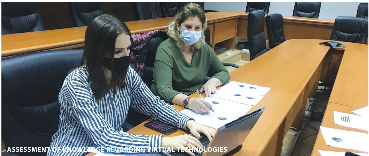
ASSESSMENT OF KNOWLEDGE REGARDING VIRTUAL TECHNOLOGIES