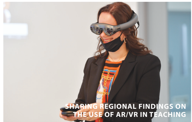
SHARING REGIONAL FINDINGS ON THE USE OF AR/VR IN TEACHING

On February 25-26th 2021, Vtech Project partners shared on a two day workshop at Polis University, where the first event was an sharing findings on the use of AR/VR, and the second one was the Steering Committee Meeting.