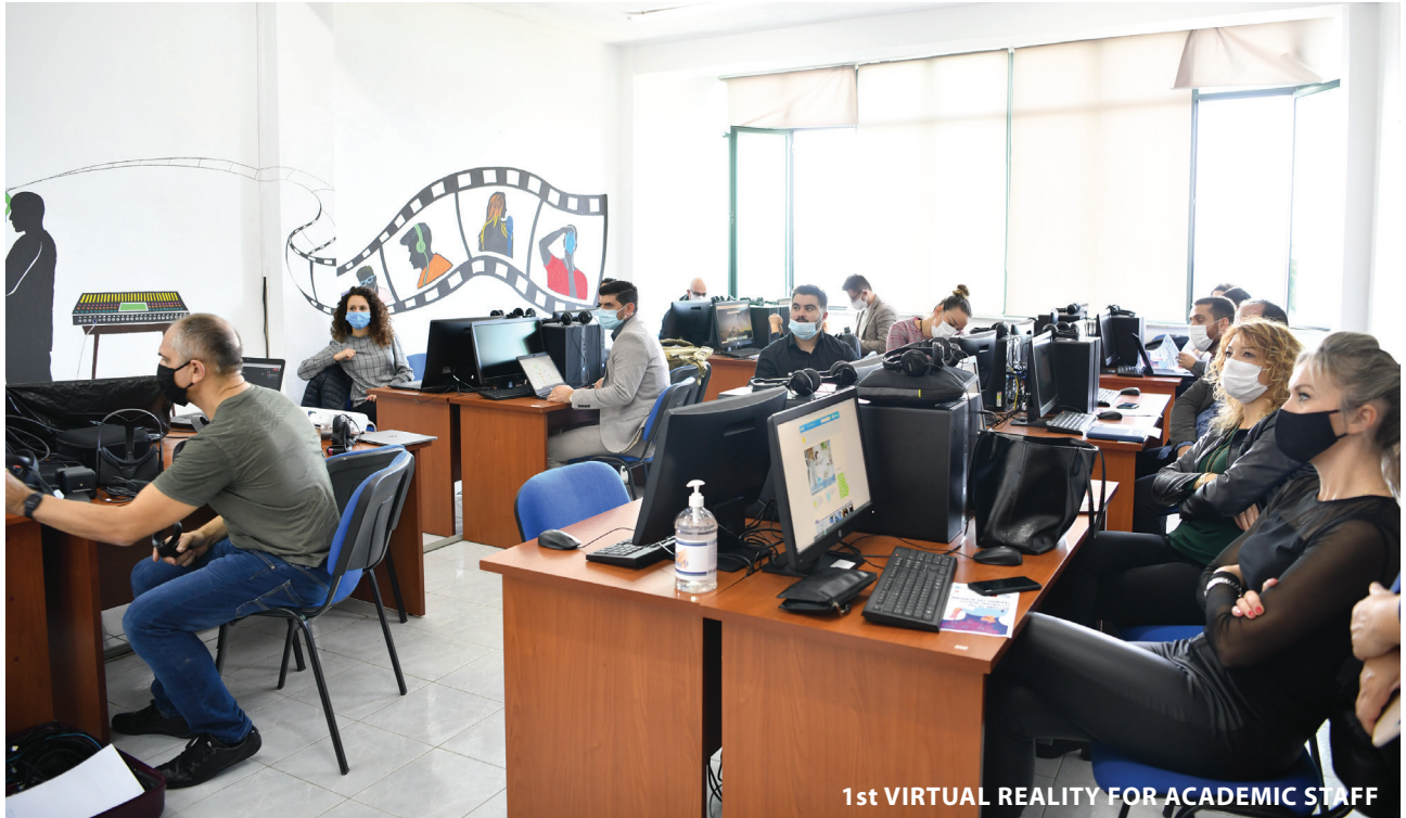
1st VIRTUAL REALITY FOR ACADEMIC STAFF