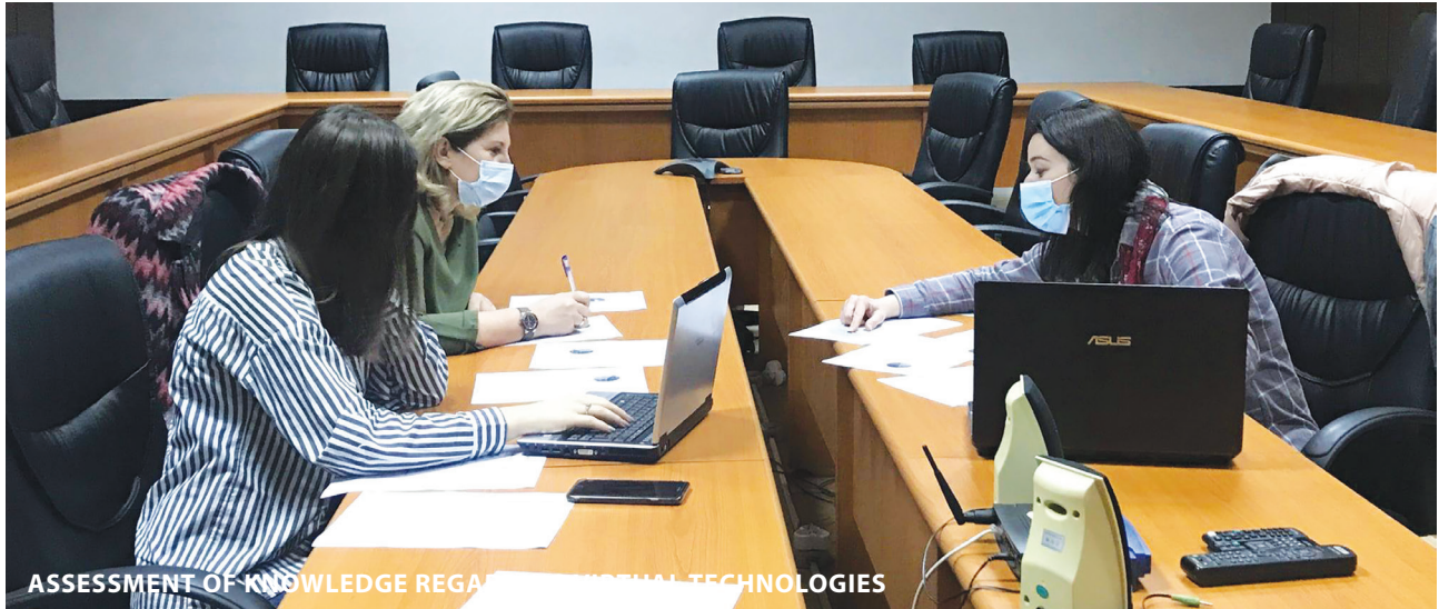
ASSESSMENT OF KNOWLEDGE REGARDING VIRTUAL TECHNOLOGIES