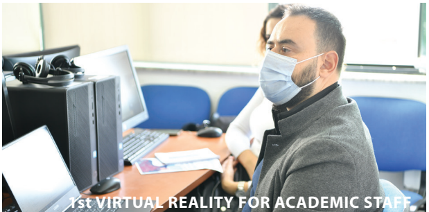
1st VIRTUAL REALITY FOR ACADEMIC STAFF

On 27th to 29th October 2020 the First Virtual Reality for Academic Staff training for the Erasmus+ KA2 project #VTechProject took place at Multimedia Lab (UAMD) premises.