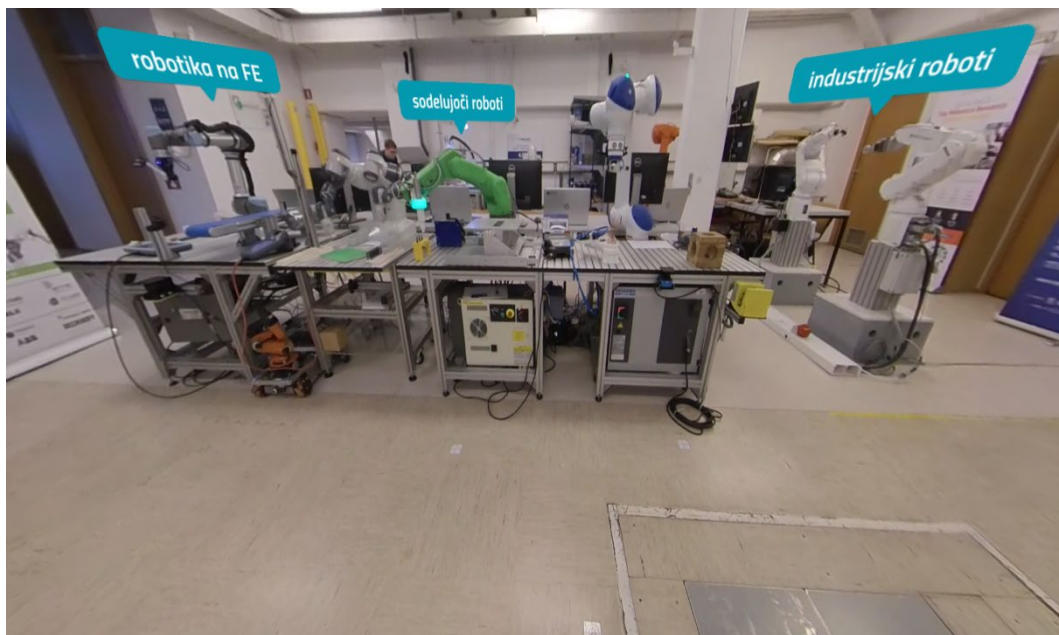
Figure 4: A virtual presentation of UL FE.

The training was concluded with a long and fruitful discussion and a Q&A session. The training was recorded and is available to participants for later viewing.