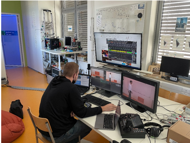
Figure 1: Temporary studio for broadcasting/streaming of the workshop over ZOOM

The training was done at the premises of the University of Ljubljana, where a temporary studio was setup for this purpose, with the possibility to show the lectures, speakers, demonstrations, mobile phone screen captures, etc.