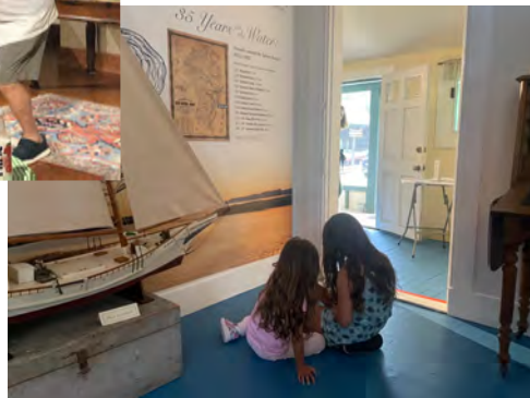
A quiet moment in the museum.

We have a lot going on these days! Keep up to date by visiting our website and social media and do not forget to sign-up on our website for our emailed newsletter Heard on The Wind .