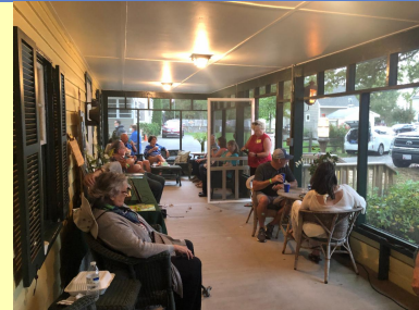
KICKING BACK ON THE PORCH