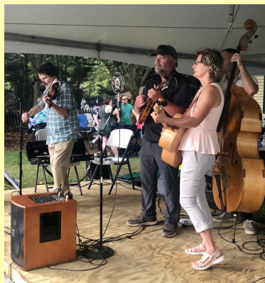
EASTMAN STRING BAND