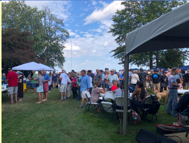
LOTS OF FESTIVAL-GOERS!