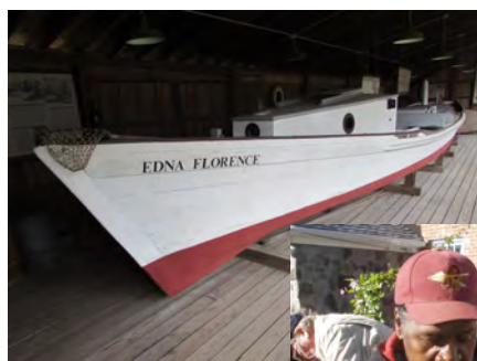
The Edna Florence