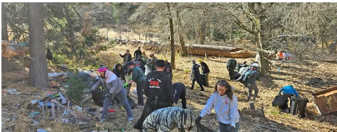
Local residents partnered with Forest Service firefighters during last December's forest cleanup project.

dumpsites and hiking trails within the forest and local mountain communities, in coordination with local volunteers. Another arm of their efforts is planting Coulter Pine seedlings. They intend to plant 4,000 seedlings in the former Line Fire area this season and they have plans to establish a nursery to cultivate and grow