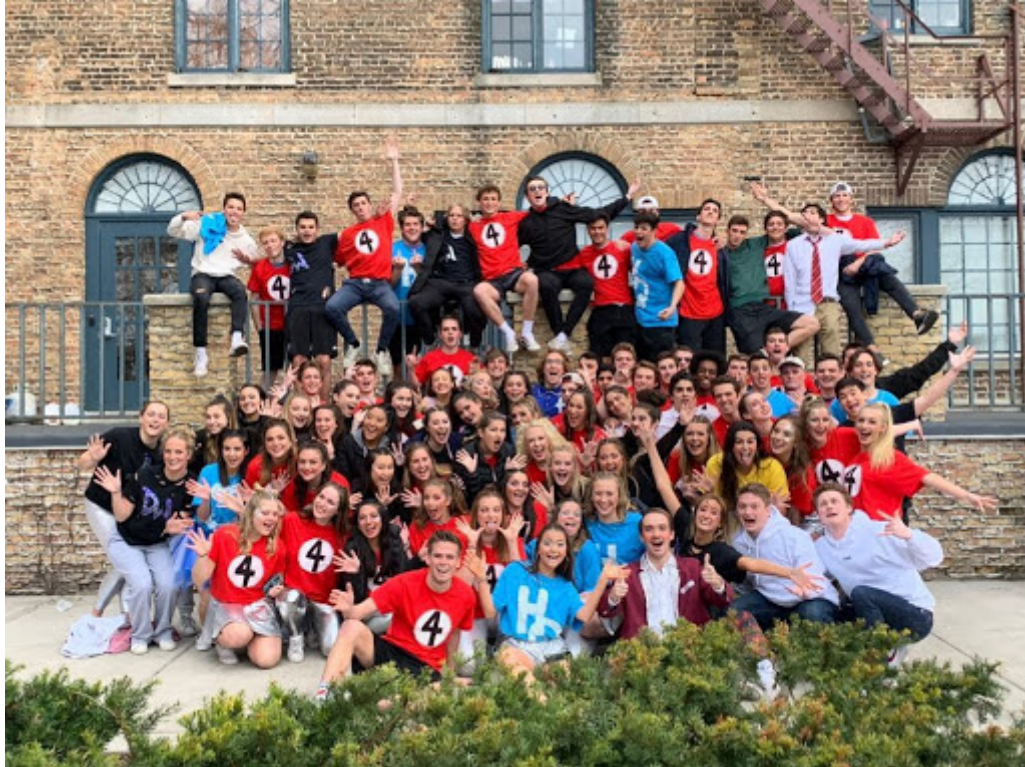
Humorology cast right before the final show

House, we are in the midst of a food drive for the Second Harvest Foodbank of Southern Wisconsin!