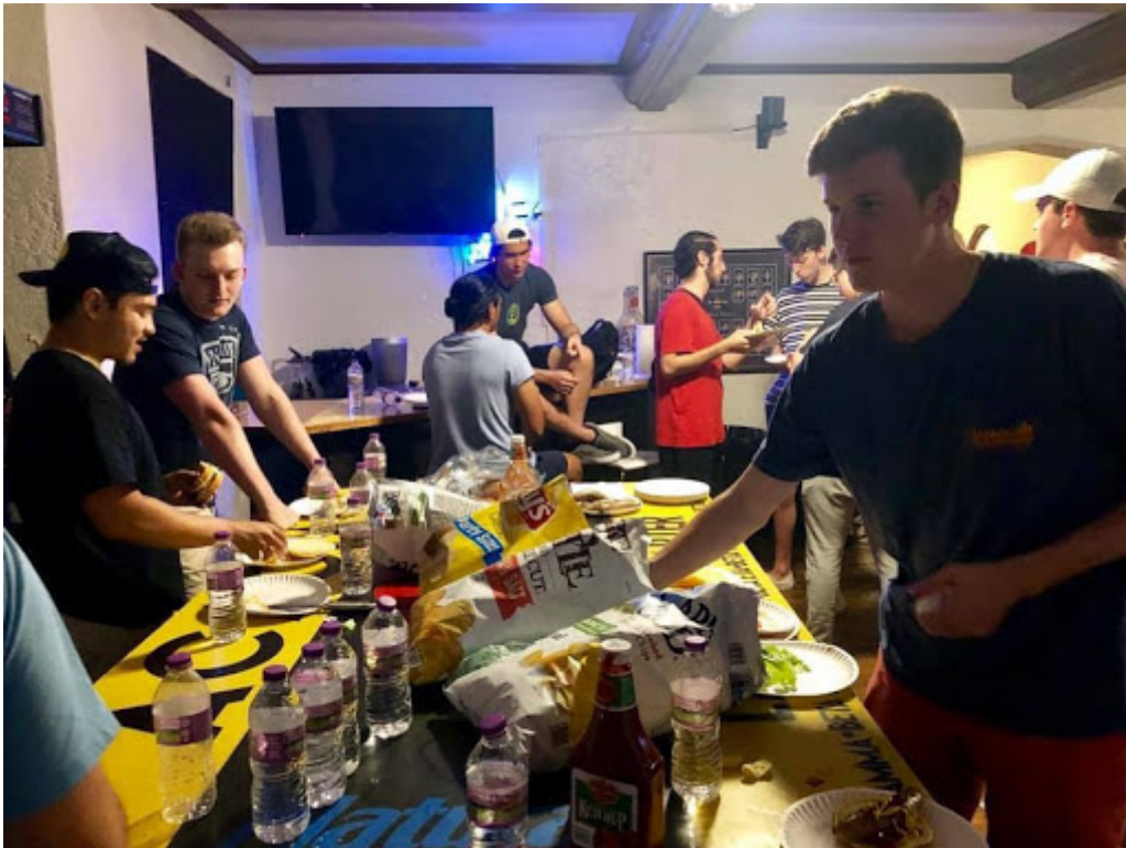
A shot of the Rush Cookout in action

I would like to thank all of you for the support we have received in the last few years, and for the help, we will be given in the coming years. As Acacians, we know that there are always three components of a triangle that need to be working in harmony for it to be complete. I see those three components as the active chapter, the alumni, and the international fraternity. With support from our alumni and the international fraternity, and our honest share of effort from the active chapter, the triangle becomes complete, and that is shown through the success that we have seen over the last few semesters. So, thank you again to everyone, I look forward to seeing many of you at Homecoming this October. So Live.