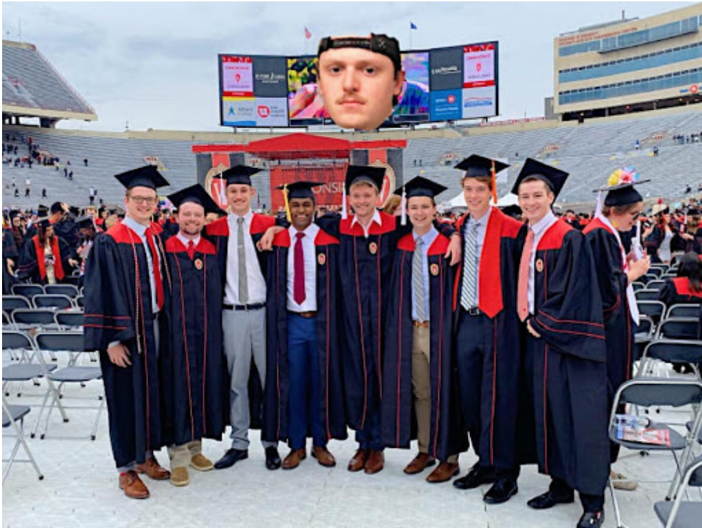
Brothers for life!