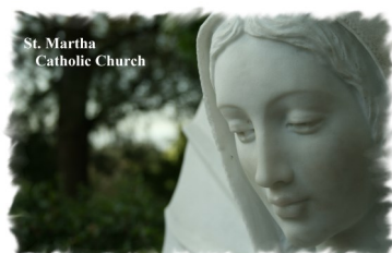
St. Martha Catholic Church