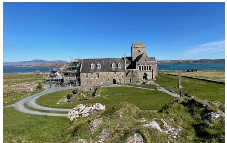
Iona Abbey

The abbey church is not heated. We wore coats and sock hats. Some wore gloves. But there was a warmth and power to the worship. Beyond the abbey guests, there are many visitors to the island and some of these will attend worship.