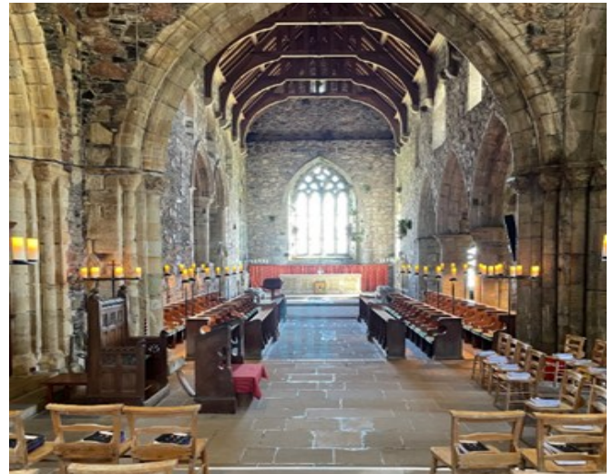
Iona Abbey Church Interior (D Russell 2026)

And then there were miracles in the history of it all. The cathedral in Glasgow had many windows without stained glass. They had been destroyed in the Reformation, and as I reflected on the religious fighting that has taken place down through the years, it is a miracle that the church survives what Christians can do to it.