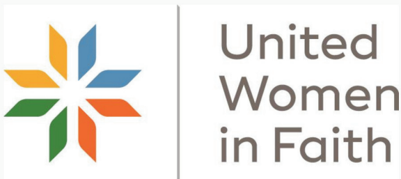
United Women in Faith

General Meeting: Every Second Saturday at 10am (Fellowship/Narthex Area)