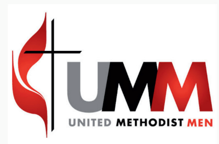
United Methodist Men

General Meeting: Every Second Saturday at 10am (Fellowship/Narthex Area)