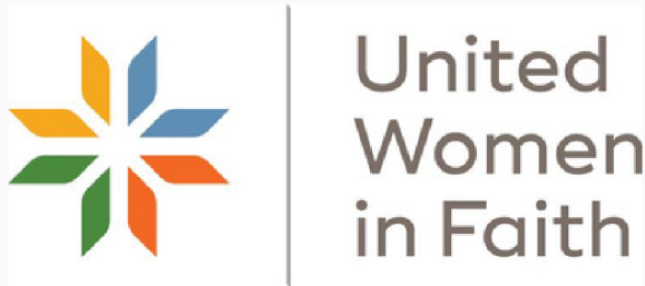
United Women in Faith

General Meeting: Saturday March 9th at 10am (Fellowship/Narthex Area)