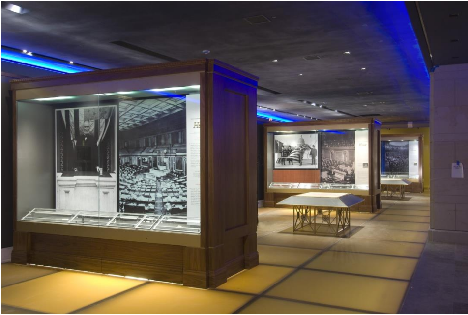
Capitol Visitor Center Exhibition Hall