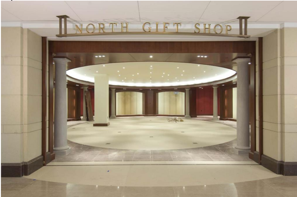
Capitol Visitor Center North Gift Shop