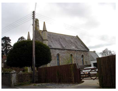
160 years later, in 2006. Notice the extension at the back, built in 1936. Out of view is the then newly completed addition with