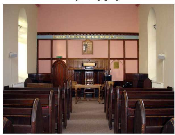
Interior before 1938