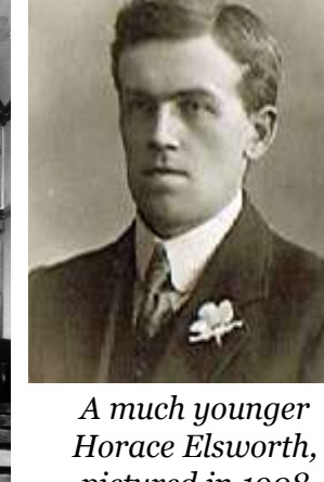
pictured in 1908