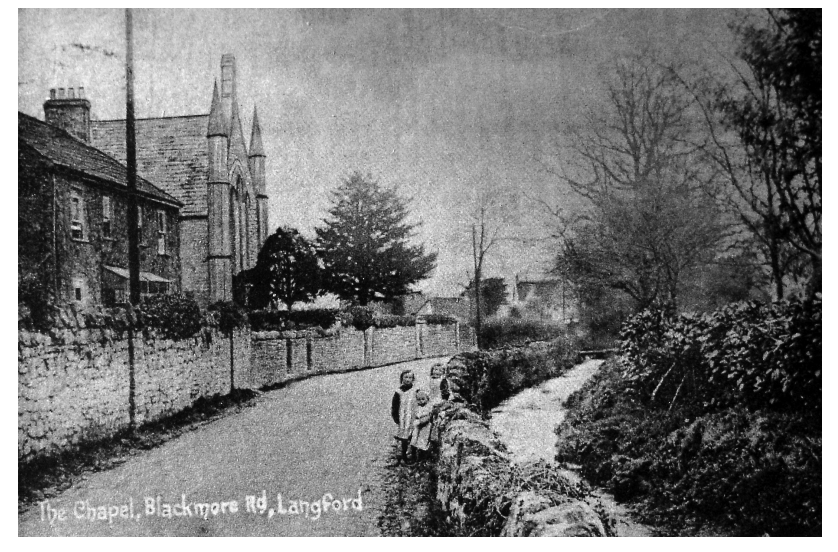
The Chapel in 1909 - from "Picture Postcards of the early 1900s -The Wrington Vale", by kind permission of Mr Stan Croker

Renovations in 1902 cost over £154, a large sum then. Despite the difficulties of the First World War, the church was generous in supporting the wider work of the Lord and in maintaining its own activities. There were at least two weddings during this period.