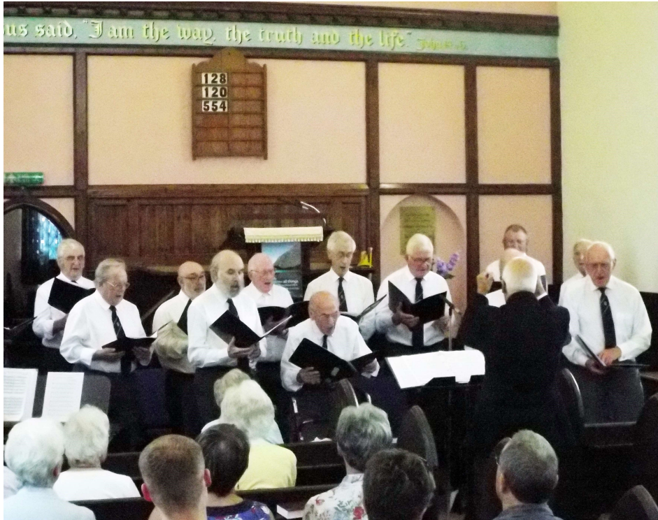
A close up of the choir in full voice: