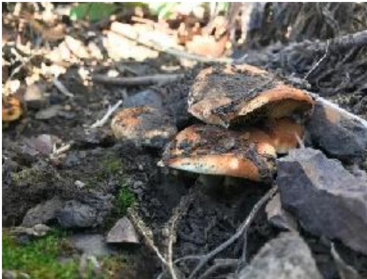
Certain fungi thrive in a post-fire environment.

Can microbes revive megafire dead zones?