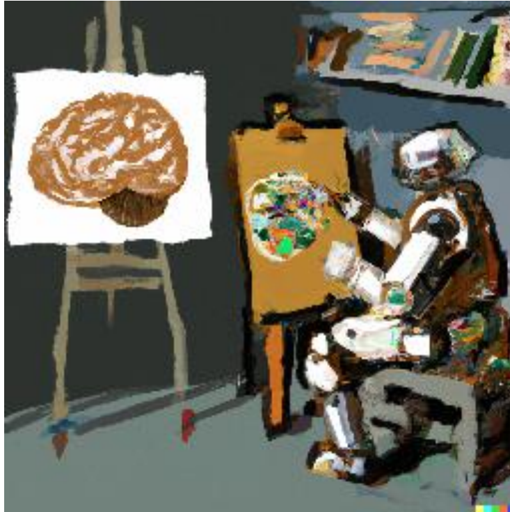
DALL-E generated image of "A robot painting a picture of a brain in an artist's studio, Rembrandt style"