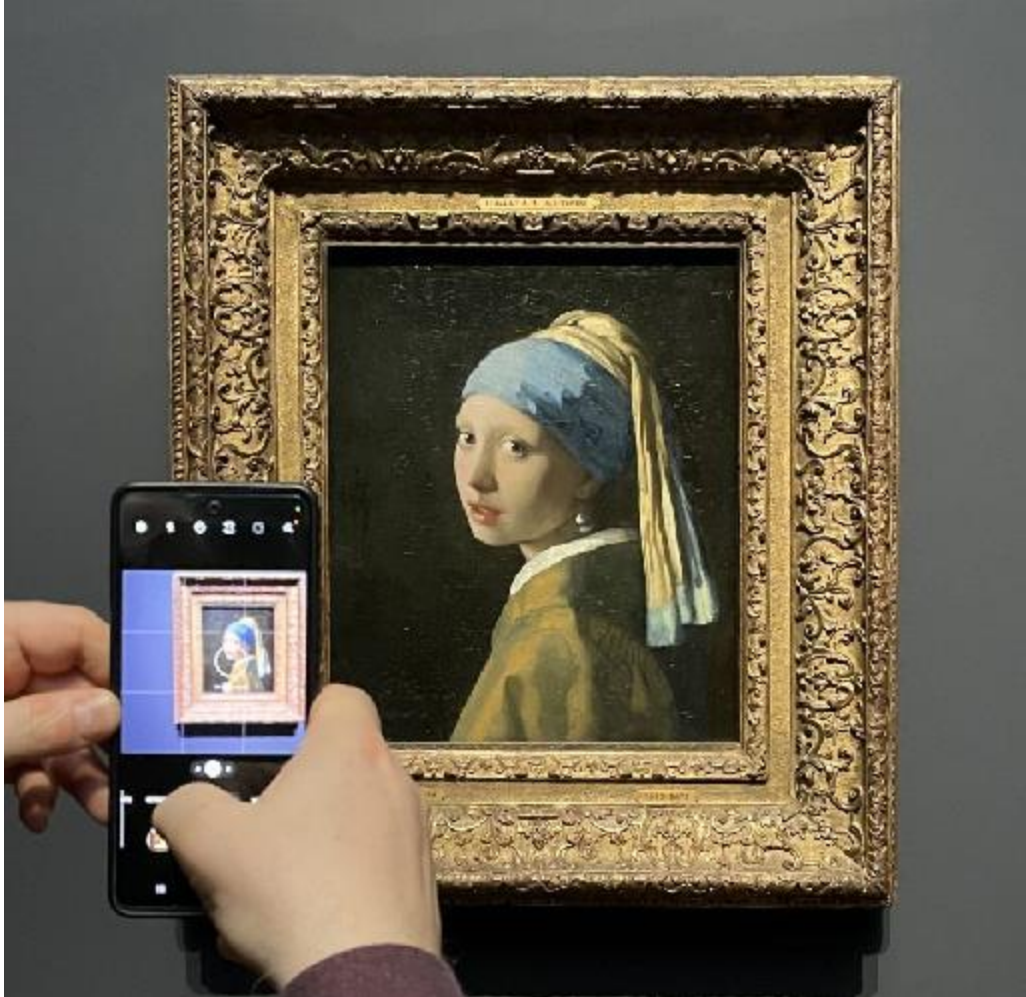
An art critic photographing Johannes Vermeer's famed Girl with a Pearl Earring during a press preview of exhibition "Vermeer" at Rijksmuseum in Amsterdam (February 7, 2023).