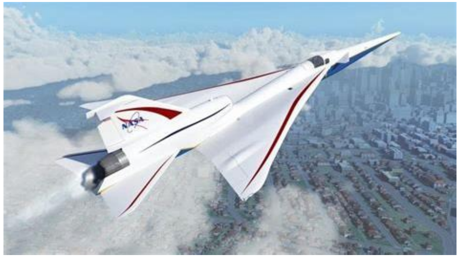
The X-59 is the centerpiece of NASA's Quesst mission, which seeks to solve one of the major barriers to supersonic flight over land, currently banned in the United States, by making sonic booms quieter.

NASA and prime contractor Lockheed Martin are developing the X-59 to reduce the sound of a sonic boom to a quieter "thump." The aircraft is at the center of NASA's Quesst mission, which will use it to gather data that could revolutionize air travel, potentially paving the way for a new generation of commercial aircraft that can travel faster than the speed of sound.