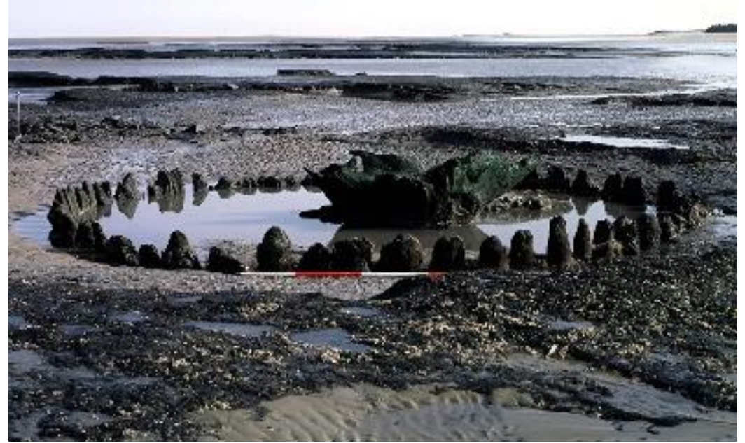
Seahenge, also known as Holme I, was made of 55 half-split oak trunks placed in an oval shape with a larger upturned oak stump in the middle.

The trees used to make Seahenge were chopped down around 2049 BCE.