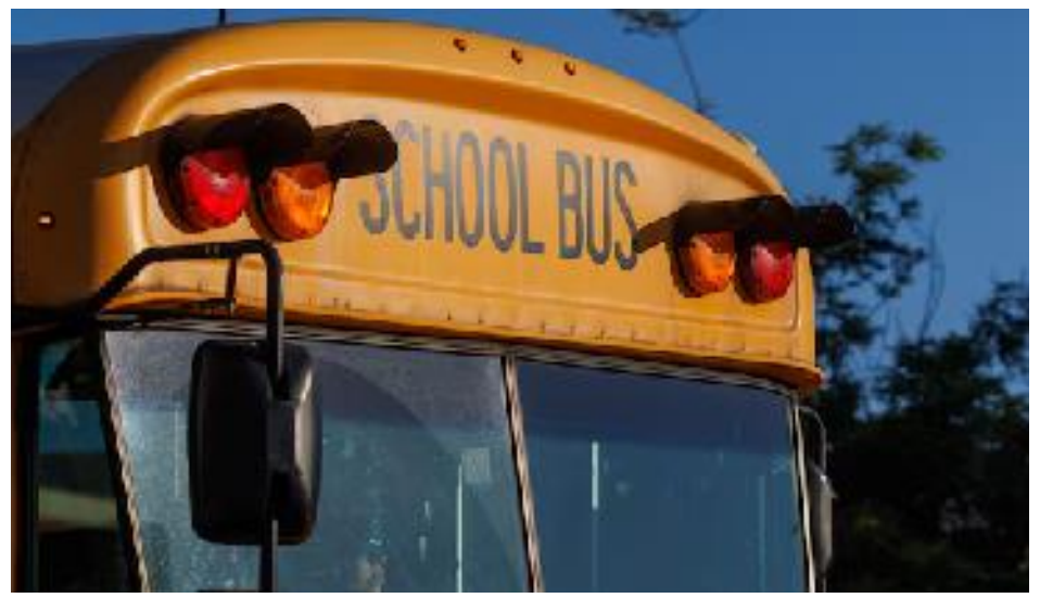
A school bus driver navigates while driving through downtown Los Angeles, California, U.S. July 19, 2023.

School administrators across the US are grappling with how to handle widespread smartphone use by kids. About 70% of high school teachers say that students being distracted by cellphones is a major problem in their classrooms, according to the Pew Research Center.