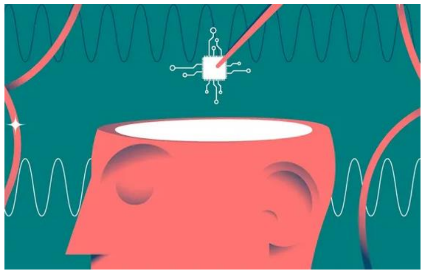
A stylized illustration of a chip being placed into a brain

Thirty-year-old Noland Arbaugh says the Neuralink chip has let him "reconnect with the world"