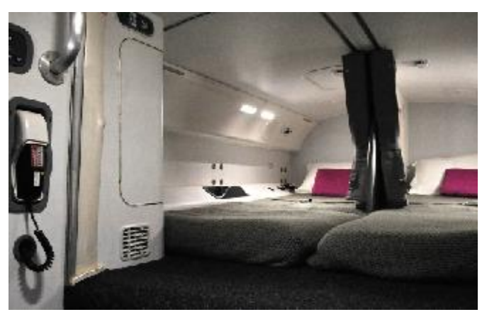
A rest room for pilots, located behind the cockpit of the Boeing 787 Dreamliner.

There are some secret areas on widebody aircraft, where the pilots and cabin crew go to rest during long flights. Passengers can't access them under any circumstance and they're well hidden from view.