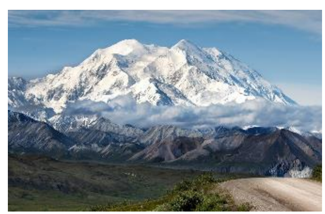
Denali National Park and Preserve—Alaska

Each one of the national parks has something new to explore whether that be historically, recreationally, or culturally. A number of them have also been recognized by the United Nations Educational, Scientific and Cultural Organization (UNESCO) and designated as World Heritage sites — that's a big deal — for their value to humanity, among other distinctions. The parks are also in flux, as all will be affected by climate change