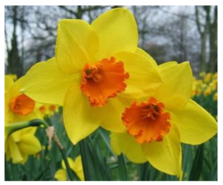
I am a guest in God's garden