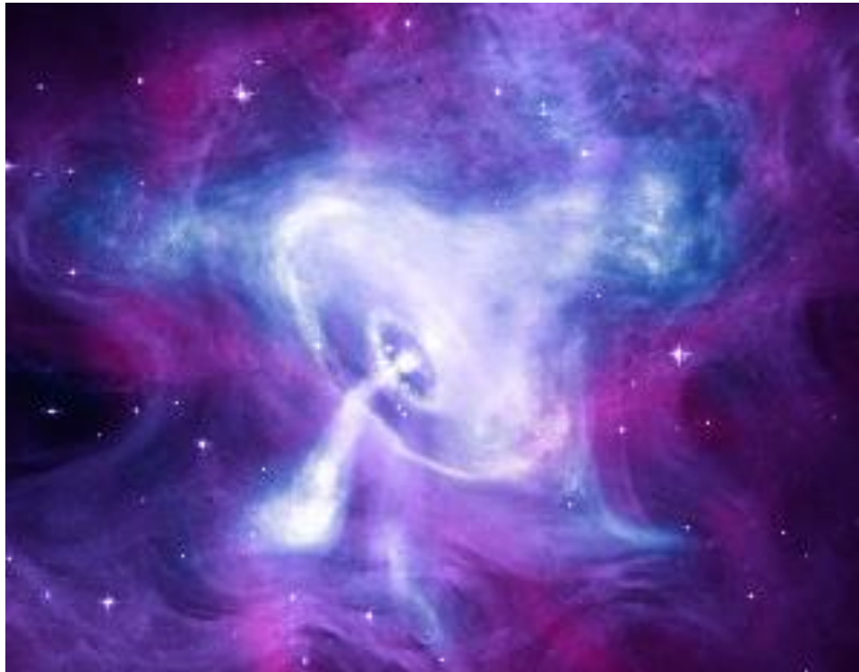
Image Credit: NASA: X-ray: Chandra (CXC), Optical: Hubble (STScI), Infrared: Spitzer (JPL-Caltech)

At the core of the Crab Nebula lies a city-sized, magnetized neutron star spinning 30 times a second. Known as the Crab Pulsar, it is the bright spot in the center of the gaseous swirl at the nebula's core.