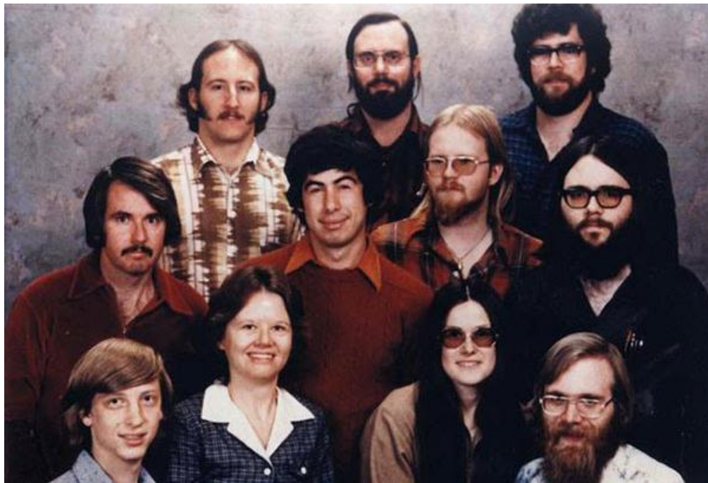
Microsoft Staff, 1978