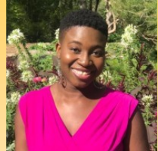
Our First Volunteer