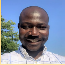
Our First President