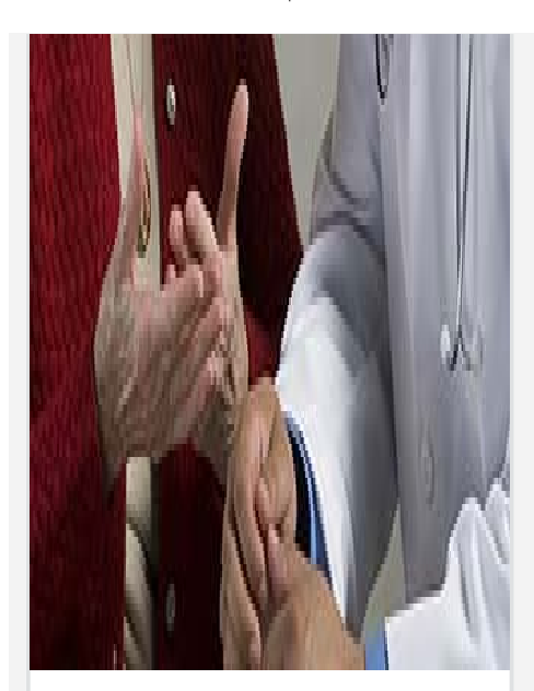
How Is Alzheimer's Disease Treated?