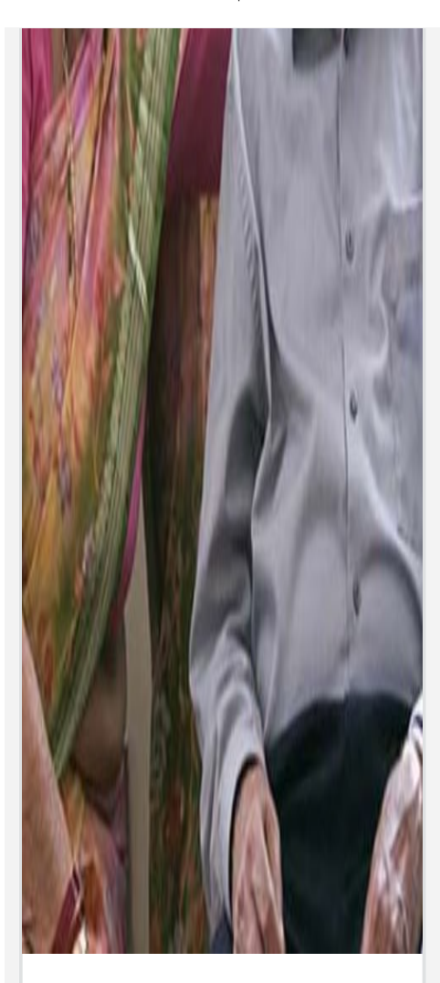
Do Memory Problems Always Mean Alzheimer's Disease?