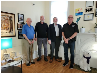
Niagara Board members visited the Learning Centre for Hamilton