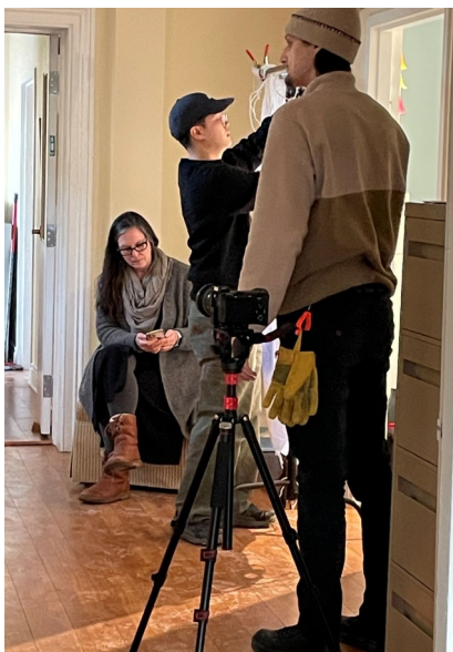
Setting up for filming—on the first floor of the Centre.