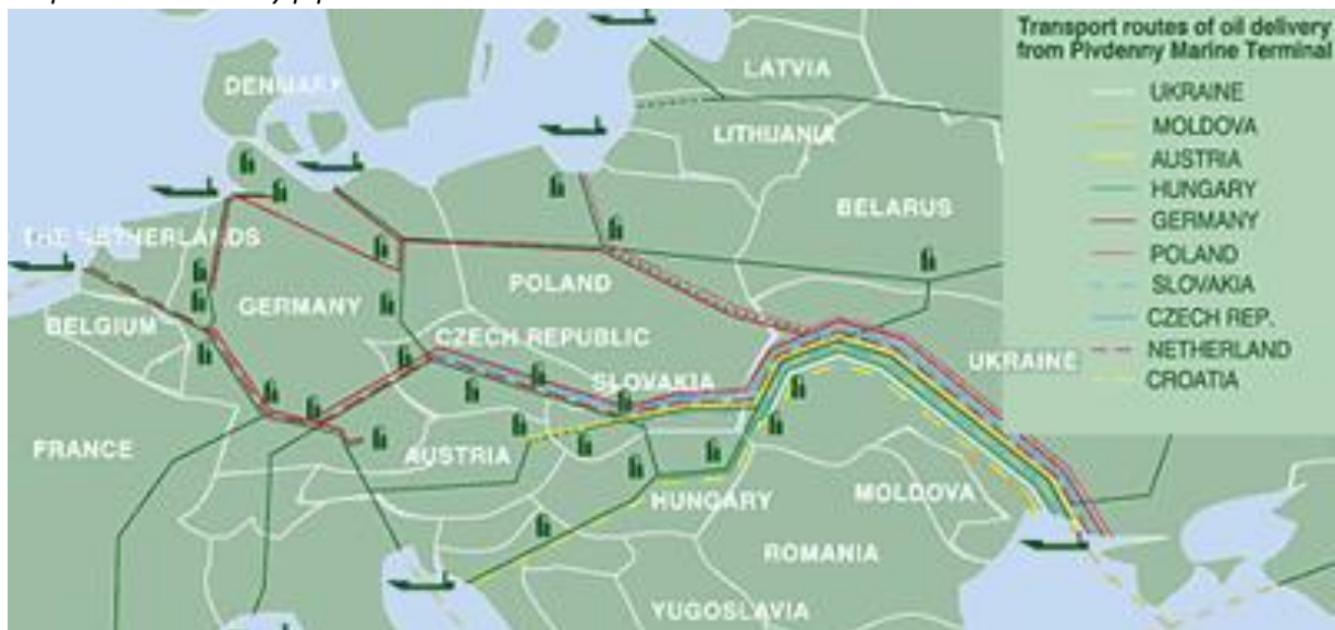
Map 3: Odessa-Brody pipeline