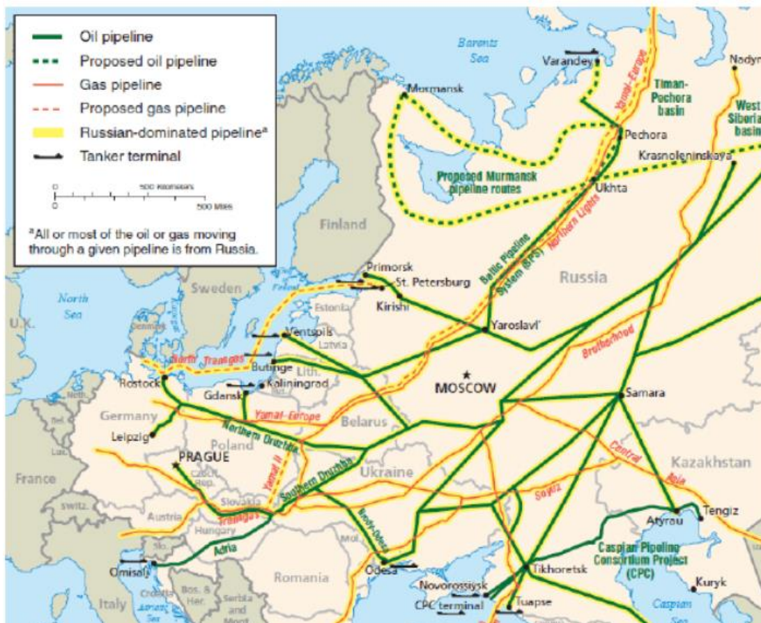
Map 1: Pipelines in the Former Soviet Union