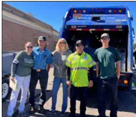
Dumpster day crew

— Respectfully, The AGHOA Board of Directors and Committee Chairs