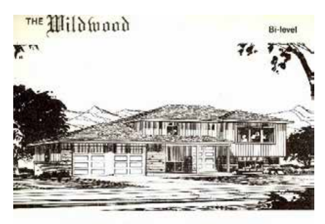
4 Bed Rooms - 2 Baths Finished Utility Area

Prices effective February 25, 1975 and are subject to change without notice. MORRIS GENERAL CONTRACTORS