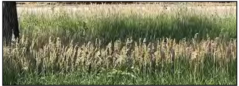
The first picture is the way the median should look – a good look

I hope this helps those who call requesting the cutting of the median at inappropriate times. Please be patient and enjoy the return of those grasses.