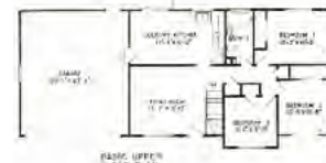
BASIC UPPER FLOOR PLAN

---THE ABOVE PRICES INCLUDE--- Special energy package, 8000 sq.ft. site with all underground utilities, 2-car garage, well to wall carpeting, electric range, range hood and disposer and a full open lower level. Please ask the salesman for other available options. OPTIONAL PRICES TO COMPLETE LOWER LEVELS BUCKLODGE $4,165 HUNTINGTON $3,930 FOXPOINT $1,999 FAIRHAVEN $2,570 FAIRHAVEN $1,795 ELKHORN $3,600 Prices effective February 25, 1995 and are subject to change without notice. HOBBS GENERAL CONTRACTORS