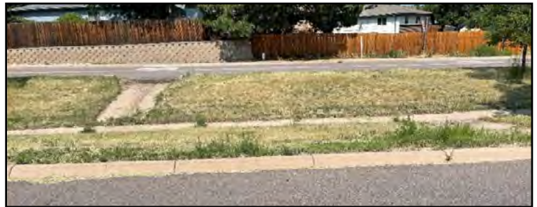
The second picture is the way one section looks now after the errant cutting – a bad look