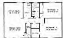
FINISHED LOWER FLOOR PLAN