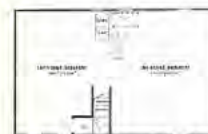
BASIC LOWER FLOOR PLAN