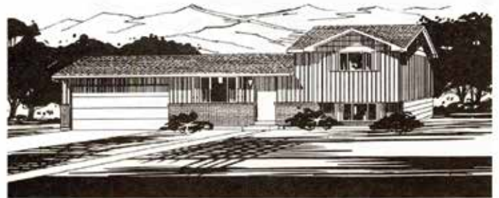
Drawings are an Artist's Conception and are not intended to show specific architectural detail.