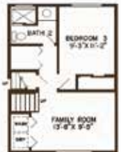
FINISHED LOWER FLOOR PLAN