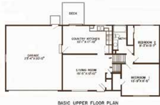
BASIC UPPER FLOOR PLAN