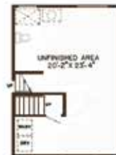
BASIC LOWER FLOOR PLAN