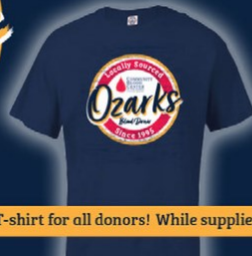
Free T-shirt for all donors! While supplies last.

HIGHLANDS CHURCH MAY 19 10:00 AM - 3:00 PM