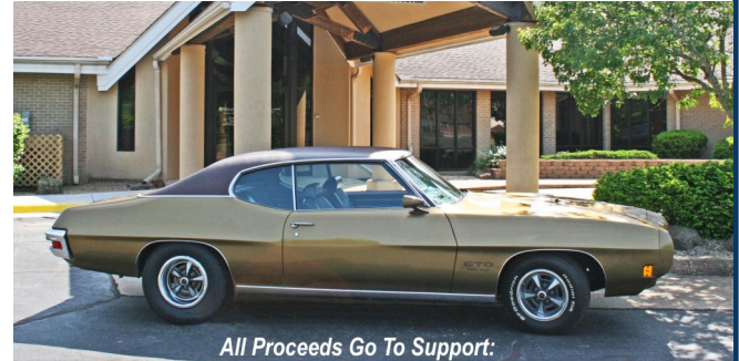
All Proceeds Go To Support: