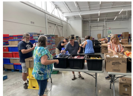
Photos of volunteers packing Snack Packs and a photo of items received by the children (taken Sept 2023).