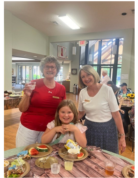
Photos are from the church picnic held on June 23. It looks like the teachers and students all had a great time!