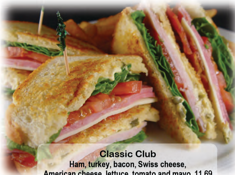
Classic Club Ham, turkey, bacon, Swiss cheese, American cheese, lettuce, tomato and mayo 11.69